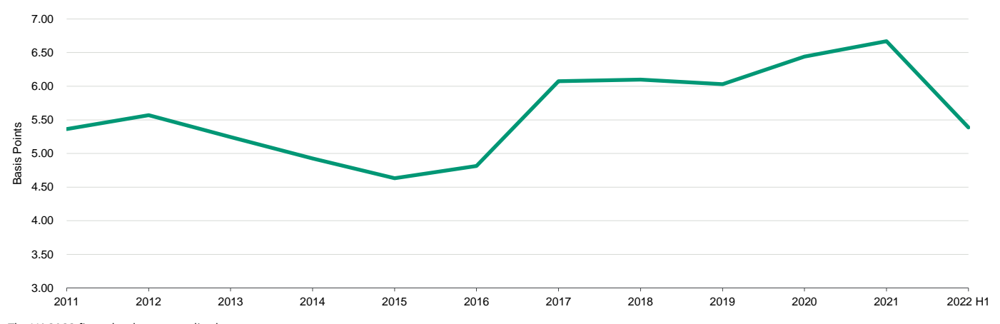
Exhibit 3 Operating expenses were low at 5.4 basis points as of the end of June 2022 KommuneKredit's operating expenses/average total assets

The H1 2022 figure has been annualised